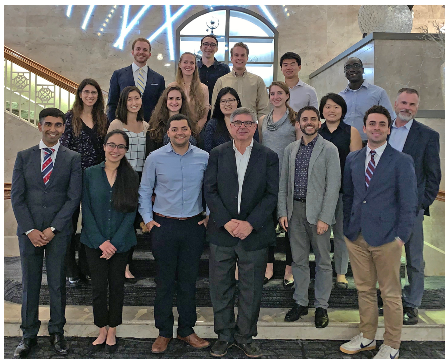
Figure 4. 2019–2020 APSA Executive Council.