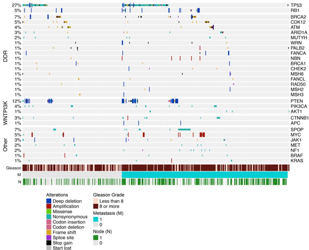
Figure 1. Oncoprint of genomic aberrations. The oncoprint includes nonsense, indels, splice site mutations, relevant missense mutations, and copy number changes for 470 untreated primary prostate cancer biopsies from patients who later developed metastatic castration-resistant disease.

Changes when assessing clinically actionable genomic alterations in patient-matched treatment-naïve and castration-resistant samples. We pursued NGS of mCRPC biopsies acquired from 61 patients participating in this study to further investigate if certain gene aberrations were detected more often in biopsies after progression on ADT and subsequent lines of therapy. Overall, we performed targeted NGS on 61 mCRPC biopsies (using the same panel as for the primary treatment-naïve samples). Copy-number profiles for both primary and mCRPC samples were compared using low-pass whole-genome sequencing (WGS) in 52 cases with sufficient DNA in both samples. Copy number estimation was adjusted for ploidy and tumor purity, since mCRPC biopsies had higher tumor content overall than the primary prostate biopsies (Supplemental Figures 5 and 6).