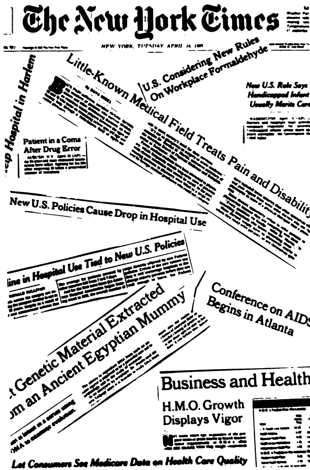
Figure 1. Contemporary issues in medicine as reported in the press.